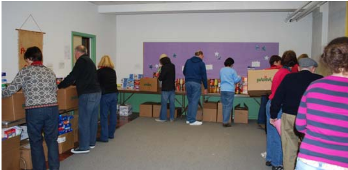
The assembly line packing holiday food.